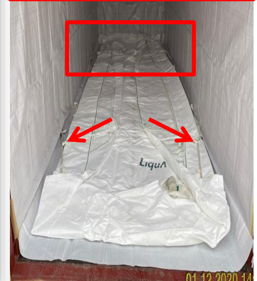
EA41 / EC41