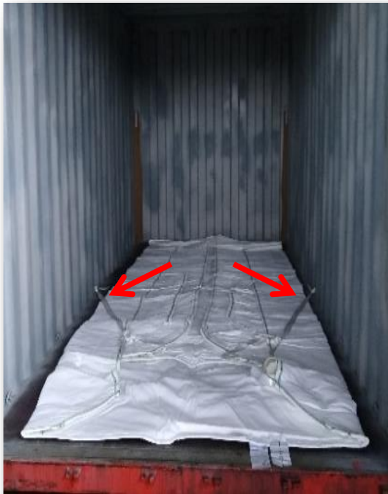
AC42 / AV42 / EA42

When the discharging is completed, untie/cut the lashing straps (shown with red arrows) fixed to the container lashing rings.